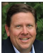
2nd Vice Chair