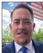
Immediate Past Chair