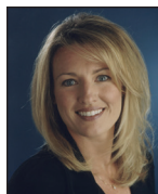
Secretary / Treasurer