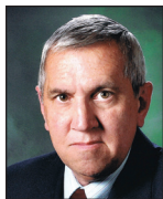
ATA State Vice President