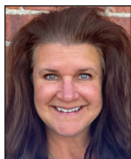
3rd Vice Chair