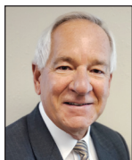
1st Vice Chair